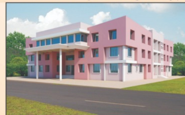
G.E.S. College of Pharmacy(D.Pharm.), Limb, Satara.