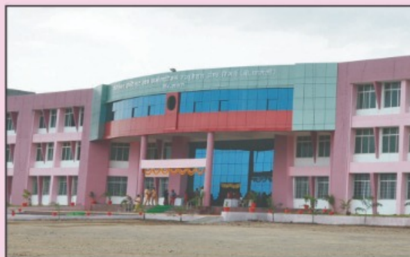
Gourishankar Institute of Pharmaceutical Education & Research, Limb, Satara.

Recognized and affiliated to Dr. Bababsaheb Ambedkar Technological University, Lonere & Maharashtra State Board of Technical Education, Mumbai.